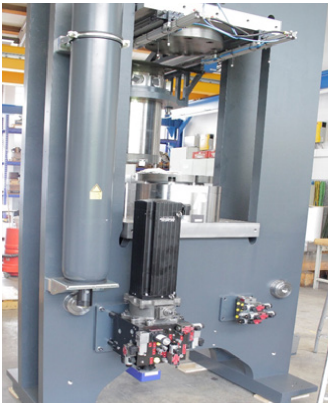
Frey EasyISO Ceramic Press Machine with the Moog EAS