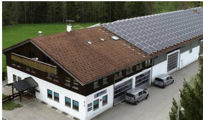
Frey and Co. facilities, Lenggries Fleck, Southern Bavaria, Germany

The EasyISO Series is equipped with a pressure vessel, a pressure intensifier and a locking cylinder built into the press frame. The machines have a modular structure for press forces ranging from 2,000 to 10,000 KN and can be tailored to specific customer requirements. In short, each press can be defined between different press pressures as well as component sizes within a specific framework.